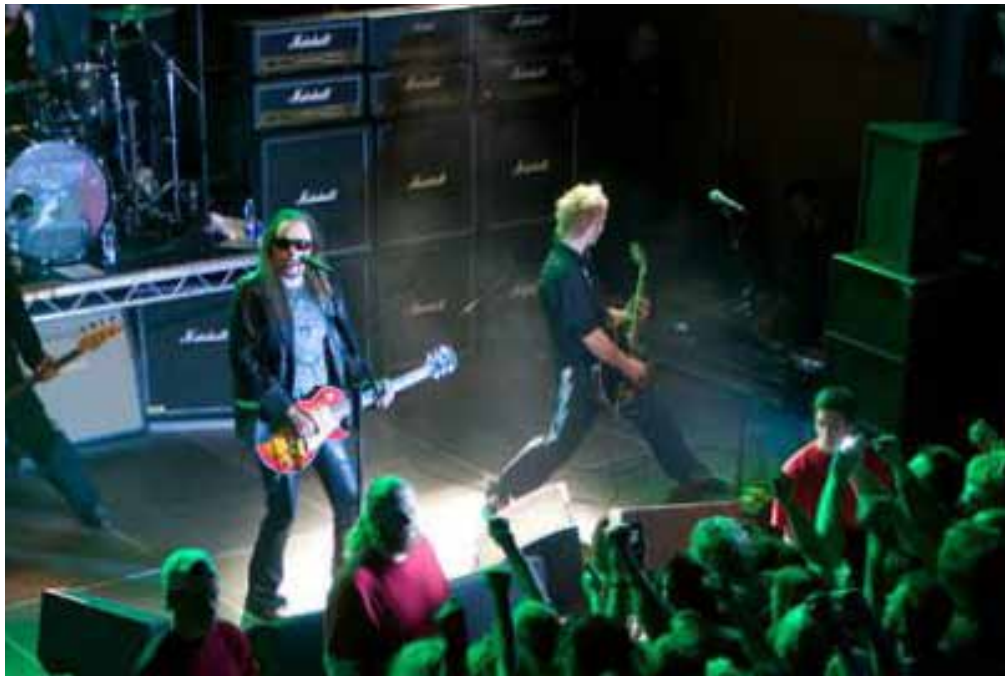
CULTUREN (VÄSTERÅS, SWEDEN)

ACTA , Milan, Italy Creative Center Carnation , Tartu, Estonia LX Factory , Lisbon, Portugal Rytmikorjaamo , Seinäjoki, Finland