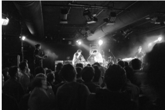
2. CONCERT ON THE A38 SHIP IN BUDAPEST.