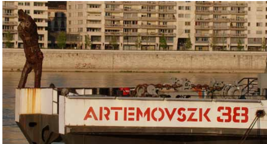
1. THE A38 SHIP, HOST OF TEH MEETING 69 IN BUDAPEST.

■ The accounts for 2008 and 2009, as well as the budget for TEH 2010 were approved.