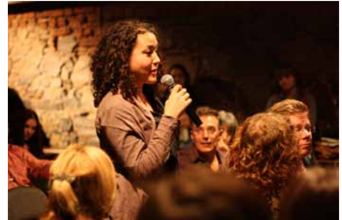
3. INTRODUCTION MEETING AT TEH MEETING 70 IN LEIPZIG.

THE BIENNIAL NETWORK MEETINGS are the principal focus of Trans Europe Halles. The meetings offer a unique opportunity for the members to network and share their ideas and experiences. Project ideas are initiated and developed and the participants are introduced to the local context and offered an artistic programme of high quality during the evenings.