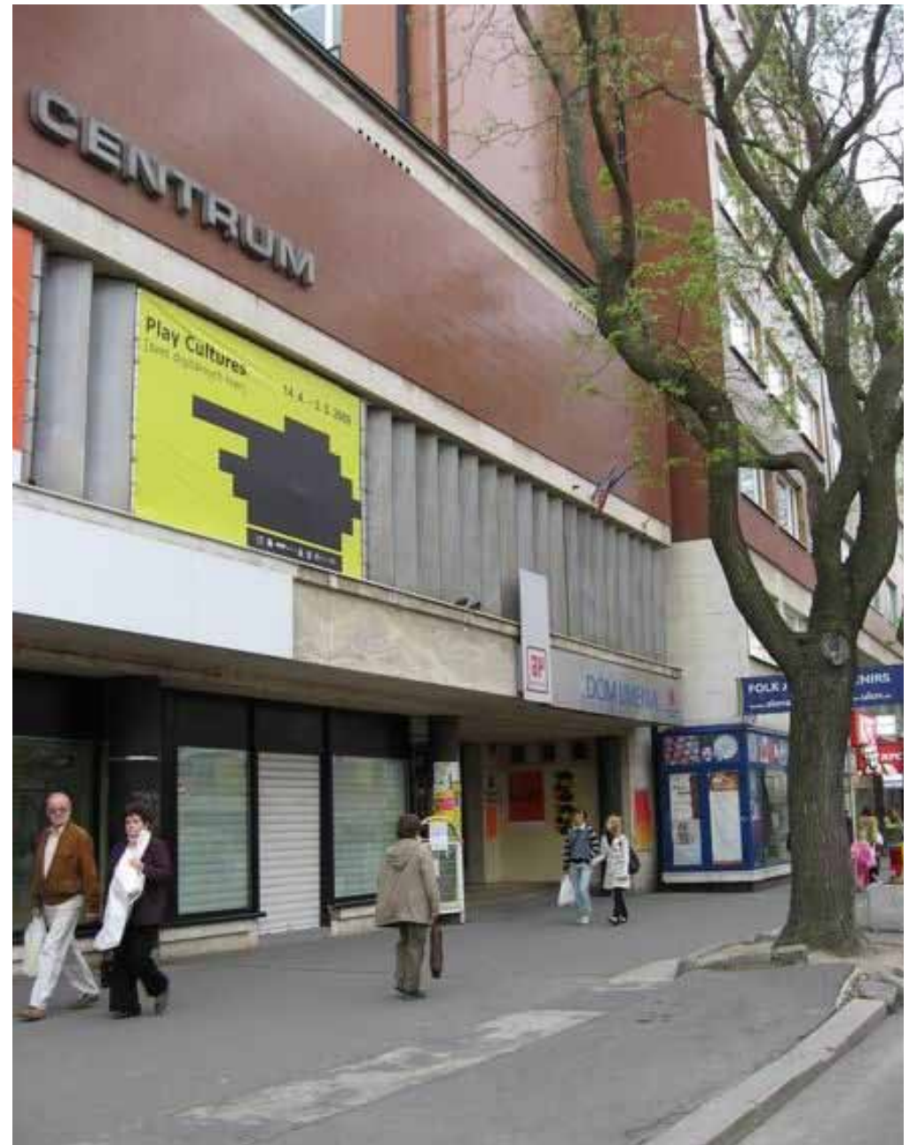
A4 - ZERO SPACE (BRATISLAVA, SLOVAKIA)