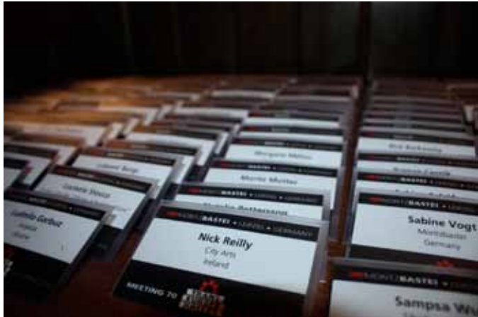
1. NAME TAGS AT TEH MEETING 70 IN LEIPZIG.