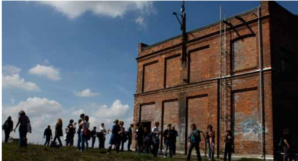
PARTICIPANTS OF TEH MEETING 70 ON THE ROOF OF LEIPZIG BAUMWOLLSPINNEREI/HALLE 14.

■ TEH:s budget for 2011 was approved. It was decided that TEH would go for Budget Option C (the biggest out of three different budget options) in 2011.