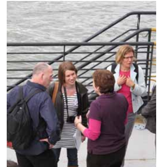
2. DISCUSSIONS ON A38