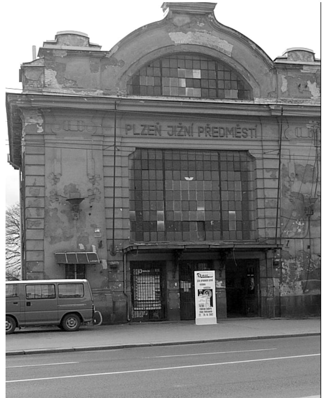
JOHAN CENTRUM ( PILSEN, CZECH REPUBLIC)