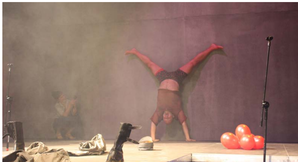
PERFORMANCE DURING THE VERY SPECIAL PRL-PARTY AT TEH MEETING 68. (PRL, POLSKA RZECZPOSPOLITA LUDOWA, WAS THE OFFICIAL NAME OF POLAND FROM 1952 TO 1989).

■ JOHAN Centrum (Pilsen, Czech Republic) was approved of and welcomed as new members of the network and Pushkinskaya 10 (St. Petersburg, Russia) was approved and welcomed as Friends (associated members) of the network.