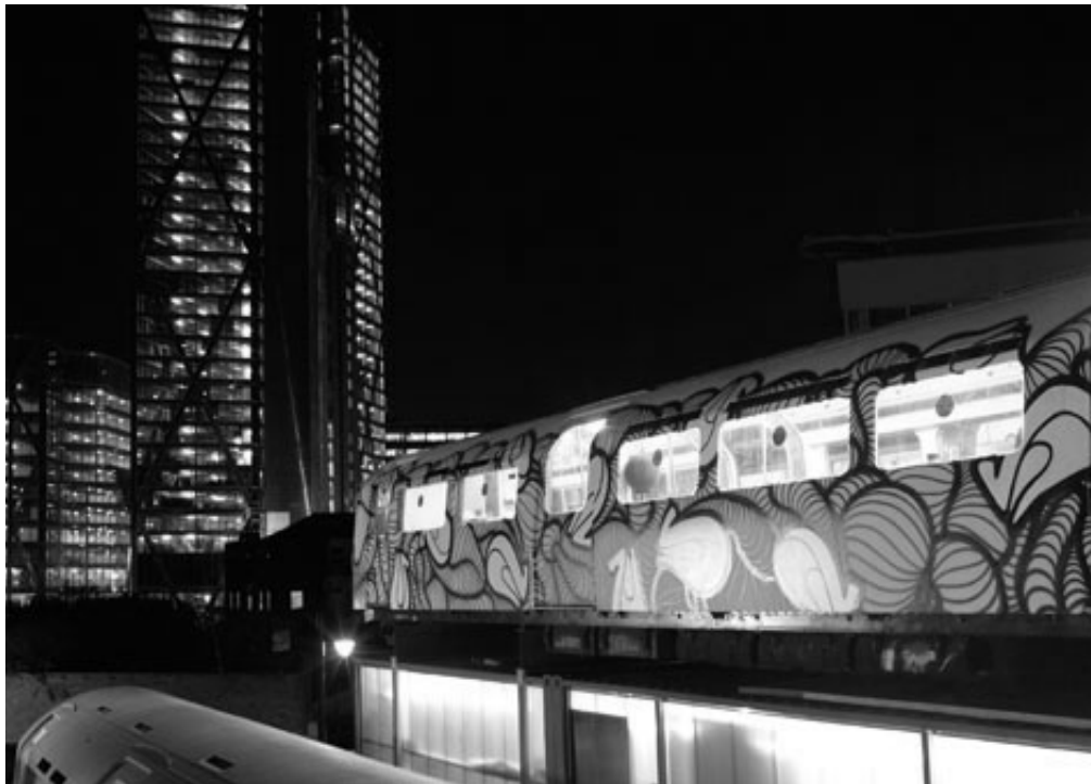
VILLAGE UNDERGROUND (LONDON, UK)